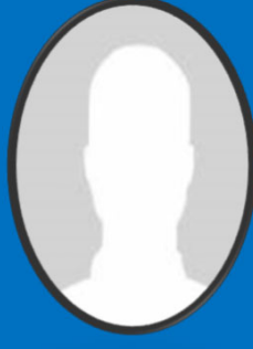
Vacant Houston Park Unit Director 940.591.3496