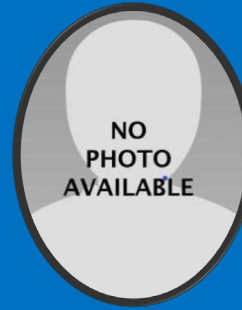
Vacant Recreation Director 940-591-3628